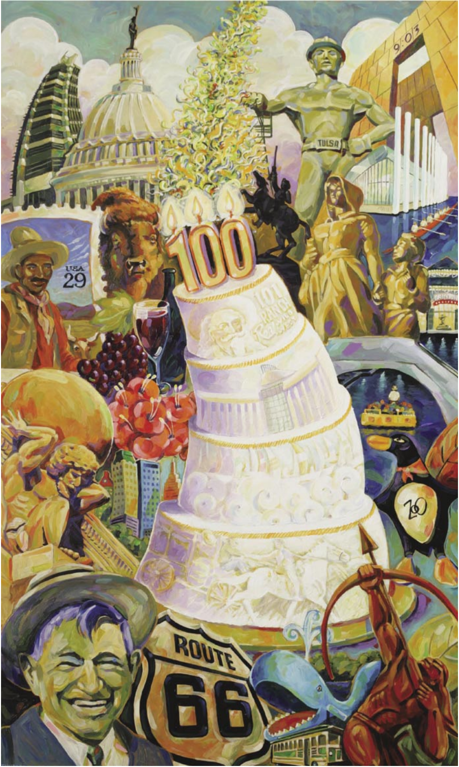
Oklahoma Museums Association Annual Fall Conference • September 26-28, 2007 • Elk City Oklahoma Celebrates 100 Years! Museums: Gift of Culture and History