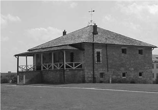
1872 Post Guardhouse.

The museum at Fort Sill was established by direction of the Chief of Field Artillery on December 10, 1934. The museum occupies 26 structures where its vast collections are both stored and exhibited. Dinner will be served at the Patriot Club, Fort Sill. Transportation will leave the hotel at 5:30pm. Photo ID is required to enter the active military base. Tickets are $30 and includes museum admission and dinner; pre registration required.