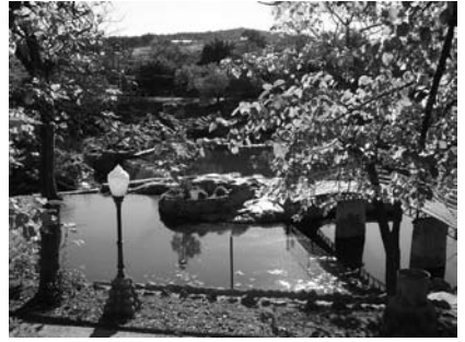
Island at Medicine Park.

The pre-conference tour will be of Wichita Mountains Wildlife Refuge, the oldest managed wildlife refuge in the nation. It will include a stop at the Visitor Center and a drive to the summit of Mount Scott for a breathtaking view of southwest Oklahoma. The tour also will include a drive through Medicine Park, Oklahoma's Oldest Cobblestone Community. Transportation will leave the hotel promptly at 1:00pm. Tour is $30; pre-registration required. Space is limited.